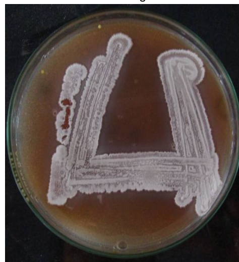
Fig. 1. Colony morphology of marine actinomycete strain MB4 on starch casein agar medium.

Screening of marine bacteria for the production of extracellular enzymes: All the 4 bacteria were screened for their ability to produce 5 different enzyme activities extracellularly. Both the bacterial strains MB1 and MB2 produced good proteolytic activity both at neutral and alkaline pH indicates the production of neutral and alkaline protease.