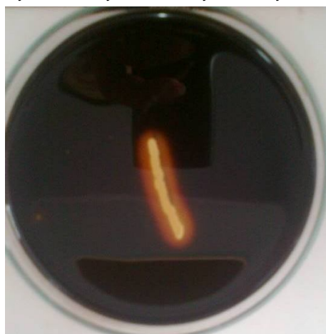
Fig. 2. Amylase activity exhibited by actinomycete strain MB3.